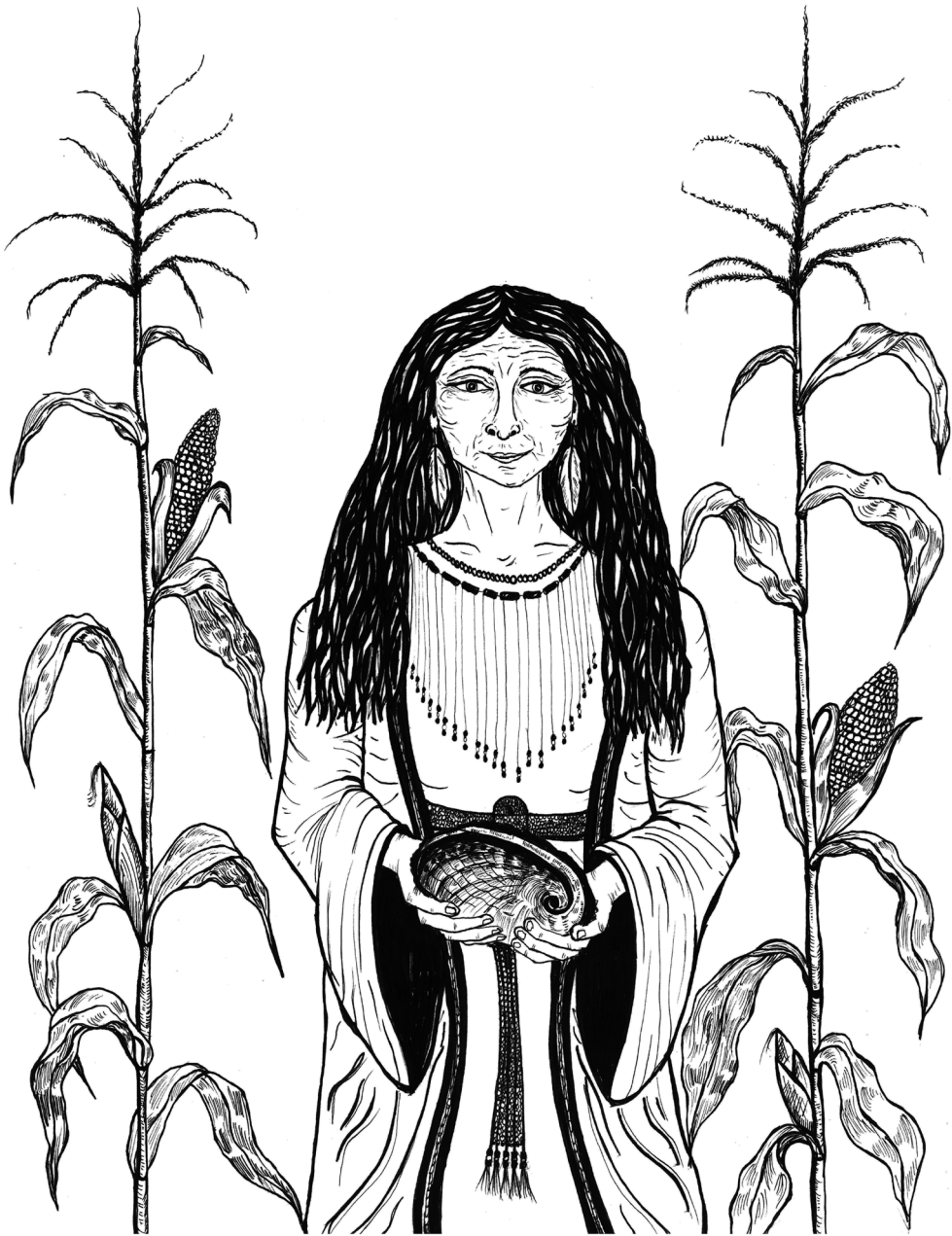
White Shell Woman. Creator and sustainer of life, enabler of beauty. Corn ( Zea mays ). The abundant one who nourishes all and promotes alignment with the Earth.