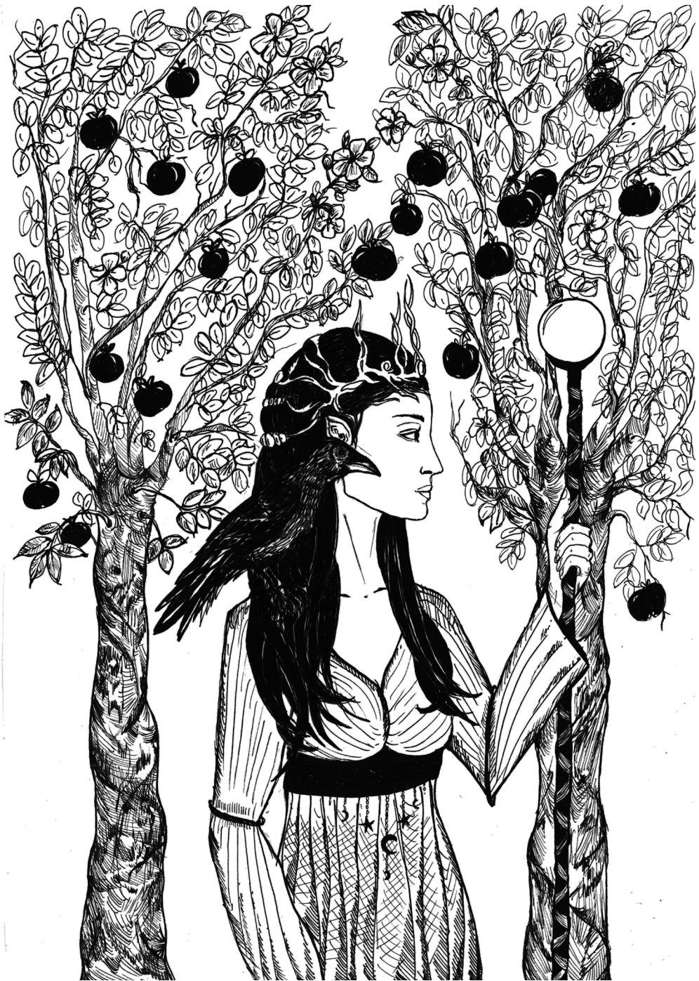
Morgan Le Fay. Lady of healing, herbs and magic, midwife. Apple ( Malus spp. ) Purveyor of beauty, abundance, love, and magic.